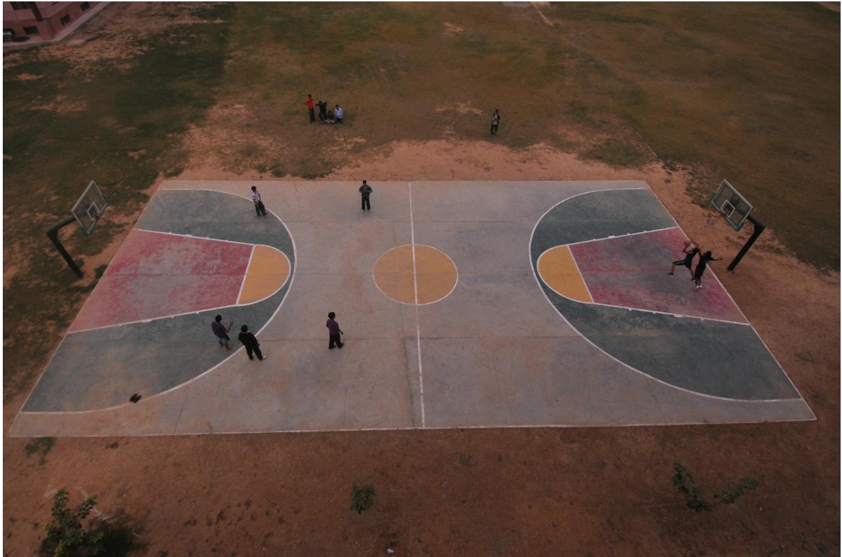
Facility for Disable